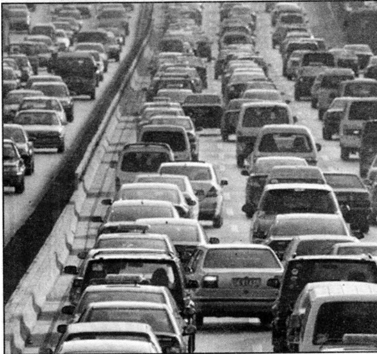
5,5 Millionen Fahrzeuge auf den Strassen.

In der Schweiz sind in 2007 387'895 Fahrzeuge neu in Verkehr gesetzt worden. Das sind 4,9 Prozent mehr als 2006. Ging die Zahl der neu in Verkehr gesetzten Fahrzeuge 2000 bis 2005 zurueck, so ist sie letztes Jahr zum zweiten Mal wieder gestiegen. Wie aus den neuesten Verkehrszahlen des Bundesamtes fuer Statistik (BFS) hervorsticht, betrifft dieser Anstieg die meisten Fahrzeugtypen.